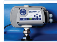
Variable Speed Option