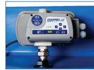
Variable Speed Option